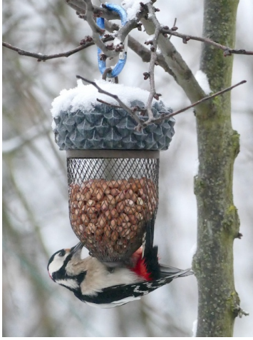
Great spotted woodpecker at the Hendrix buffet