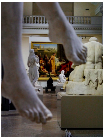
Lyon's Fine Arts Museum