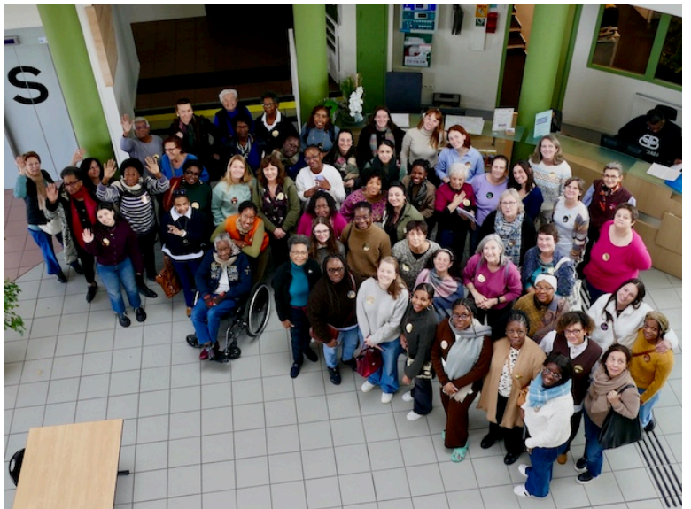
Ladies' spiritual retreat in Lyon

French-speaking Europe: The annual ladies' retreat is usually held in Lyon (the most central location). This year they had 60 participants. This is always a highlight of the year for our sisters in Christ and often non-Christians who attend to learn more about God.