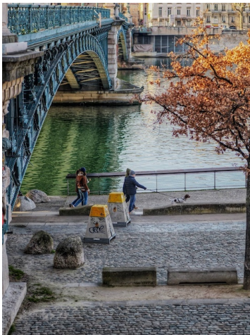
Rhône River and Fourvière Basilica in Lyon