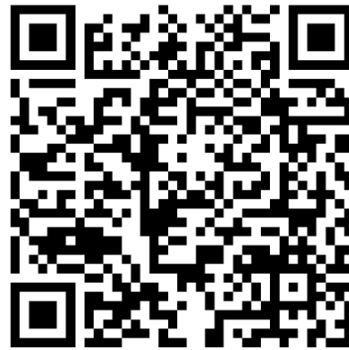
Secure online giving

www.shelbygiving.com/App/Form/45a3a9cd-47db-47d8-bd96-11a6bf9fb281