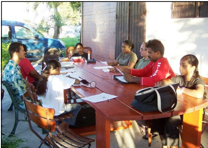
Home Bible study in Guadeloupe